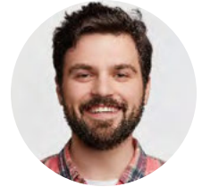
CEO Fuel petrol companies

CHALLENGES: Looking for reliable partners, synergies and monitoring. Maximize financial conditions through leveraging by volume from several countries.