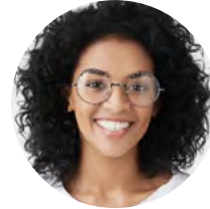
Chief financial officer

CHALLENGES: Operating new use cases, that are easy to deploy and manage. Being able to manage and monitor easily transactions from all their petrol stations.